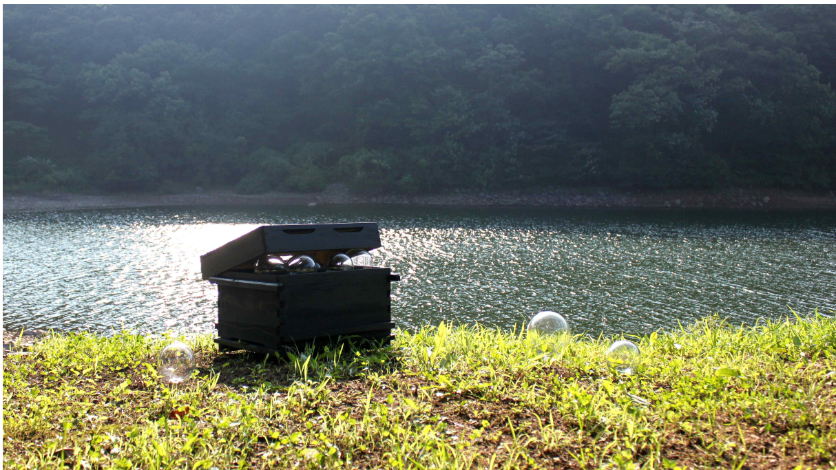
The End: Honeybee's Travel