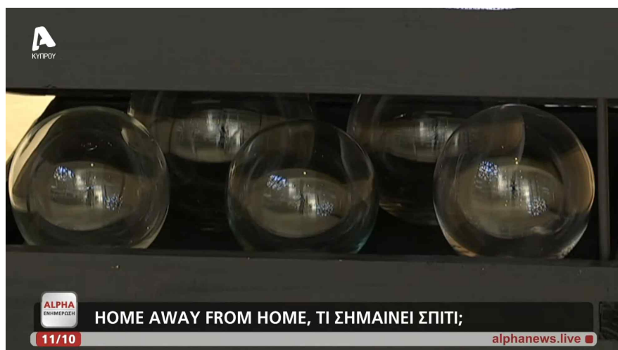
κιφροσς 현지 뉴스에 소개된 작품 이미지(Alpha News)