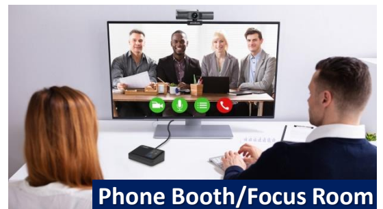
Phone Booth/Focus Room 2-3 persons