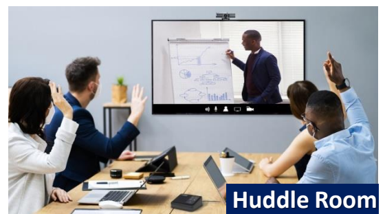
Huddle Room Up to 5 persons