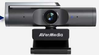
PW515 4K Ultra HD Webcam