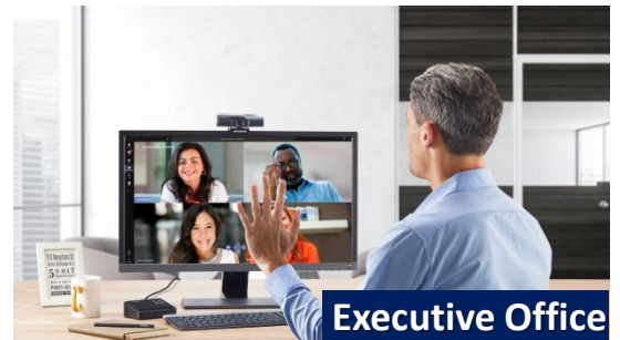
Executive Office 1 person