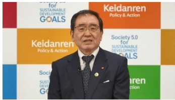
TOKURA Masakazu Chairman, KEIDANREN (Japan Business Federation)

Keidanren Chairman Tokura proposed that green transformation (the fundamental transformation of economy and society) should be promoted in order to achieve carbon neutrality. He also mentioned that the Japanese business community would steadily promote proactive measures such as the "carbon neutrality action plans," "challenge zero," and "information disclosure" together with the government.