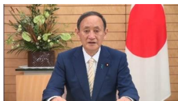
SUGA Yoshihide Prime Minister

[Video message from Prime Minister Suga]