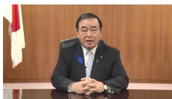
KAJIYAMA Hiroshi Minister of Economy, Trade and Industry

Minister Kajiyama expressed his intention to direct all available policies toward achieving carbon neutrality. He also expressed his expectations that this event would provide the world with an opportunity to learn about Japanese companies, and trigger changes and efforts toward decarbonization and other initiatives.